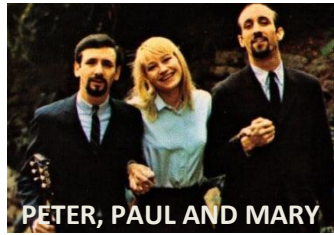
PETER, PAUL AND MARY

We’ll listen to recordings by Peter, Paul and Mary, Joan Baez, the Almanac Singers, the Weavers, Burl Ives, Pete Seeger, Paul Robeson, Harry Belafonte, Bob Dylan, Judy Collins, Woody Guthrie, Leadbelly, the Limeliters, and many others.