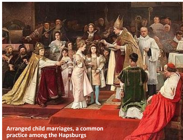
Arranged child marriages, a common practice among the Hapsburgs

This course approaches history from an unusual perspective—that of a single family, the Hapsburgs, whose dynasty lasted 1,000 years, from 1020 to 1918. How did they do it? Genealogical endurance: they were survivors. Generation after generation they produced male heirs; if sons were missing, then cousins and nephews were, with one exception, always at hand. They were fortunate too in their political alliances, but even more so in their marital alliances. They had enormous dynastic success in their arranged child marriages, as celebrated in the famous 17th century saying “Let others wage war, you happy Austria, marry.” But there was a downside to this focus on arranged marriages: inbreeding, or royal incest, if you will.