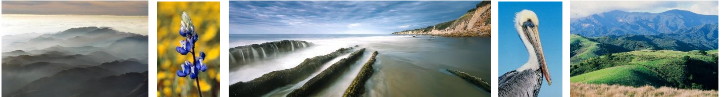
BELOW